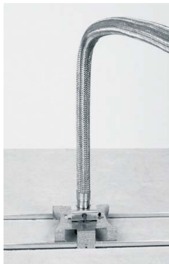
Standard Profile Sprinkler